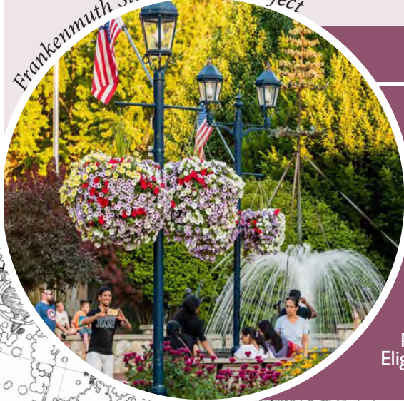
Frankenmuth Streetscaping Project