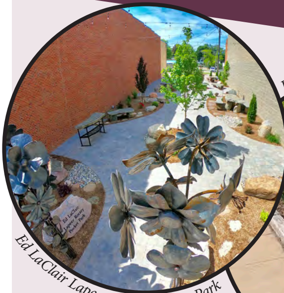
Ed LaClair Lapeer Rotary Pocket Park

Winning projects will be featured in The Michigan Landscape magazine, in media press releases, and on our websites MNLA.org and PlantMichiganGreen.com.