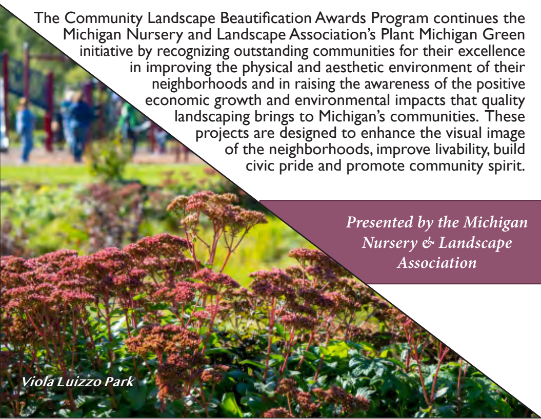
Viola Luizzo Park

Presented by the Michigan Nursery & Landscape Association