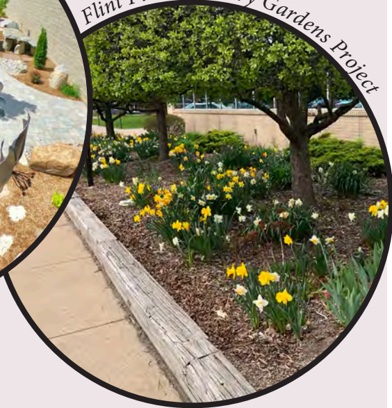
Flint Public Library Gardens Project