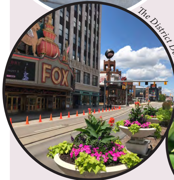
Marquette Streetscape Beautification