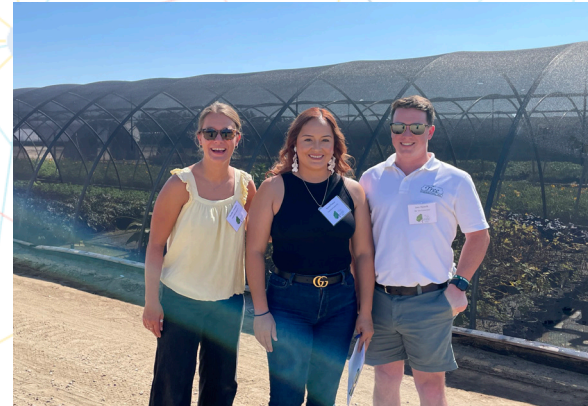
Members of the MNLA Young Professionals steering committee