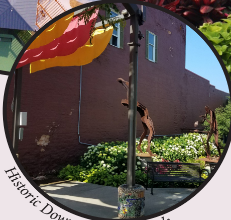
Historic Downtown Big Rapids