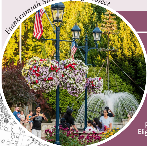
Frankenmuth Streetscaping Project