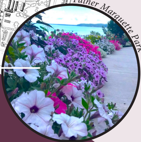
Father Marquette Park