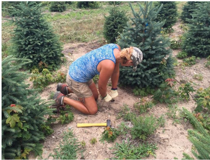
Lysimeter installation. Figure 2 (top) auguring pilot hole. Figure 3 (Right) inserting lysimeter sampling tube.

*1 oz. of N applied per tree each spring prior to budbreak