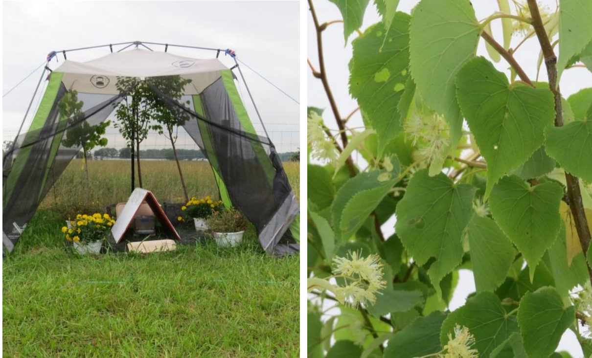
Figure 4. Screen tents used for enclosing bumble bee colonies with treated or control Tilia trees for a 10-day period. Clean marigold and portulaca were included as a source of pollen.

flowers from all trees in screen tents were collected on day 5 of the 10-day exposure period. A nectar wash method was used to determine the amount of imidacloprid in the nectar.