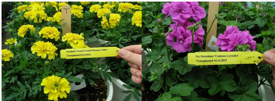
Figure 1. Marigold, geranium (below) and five other popular annual flowers were grown in 12” pots. Half of all pots received a soil drench treatment of imidacloprid at 5 weeks before shipping.

flowers varied from 0 for geranium and marigold, to 292 ppb in petunia (Table 1). Imidacloprid concentrations in whole flowers of petunia, verbena, portulaca and begonia were high enough ( > 25 ppb) that undesirable levels of imidacloprid could appear in nectar or pollen,