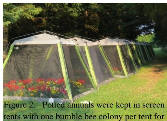
Figure 2. Potted annuals were kept in screen tents with one bumble bee colony per tent for an exposure period of 10 days.

flowers varied from 0 for geranium and marigold, to 292 ppb in petunia (Table 1). Imidacloprid concentrations in whole flowers of petunia, verbena, portulaca and begonia were high enough ( > 25 ppb) that undesirable levels of imidacloprid could appear in nectar or pollen,