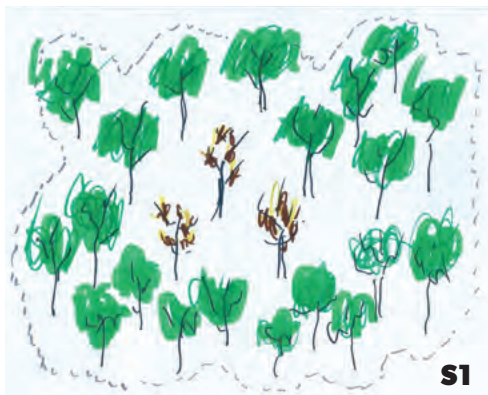
1A & 1B Photo 1A and 1B: Oak Wilt can initiate drastic (and costly) changes to Michigan landscapes. The owners of this residence bought this house approximately 15 years ago because of the abundance of trees. During the spring of 2015, their trees were pruned by a “professional arborist”; most of the pruned trees (except two, center) contracted oak wilt (Photo A). After removal of dead trees, trenching to sever root grafts, and trunk injections with propiconazole, they hope to save the two trees in their front yard and other trees on their property while (hopefully) preventing OW from advancing into their neighbors’ properties (Photo B).

Note: The 95% Trench and 98% Trench (Root Graft Disruption) represent Confidence that the trench line will actually contain Oak Wilt to within the trenched area; they may be considered as primary and secondary trench lines. (This is an abbreviated Table.)