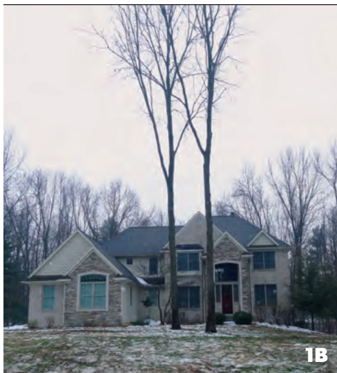
Figure 1: The Costs of Oak Wilt